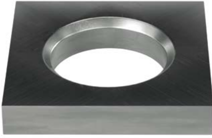
Plate washer dimensions

The standard dimensions of the Elocone plate washers follow the minimum recommendations of the AISC Design Guide 1 - Base Plate and Anchor Rod Design , second edition, with an adaptation to the unique shape of the Elocone nut. The thicknesses can be increased according to the type of anchor or the needs of the designer. It is the responsibility of the structural engineer to design the plate washer according to the anchor loads.