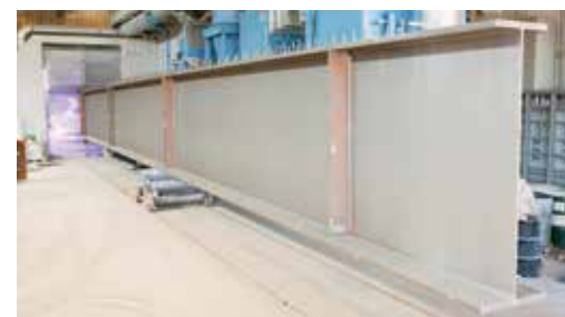
No size or shape limitations