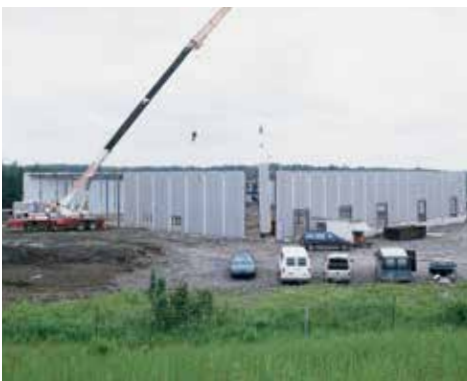
Construction in progress

Simultaneous installation of the structural steel components and the wall panels begins.