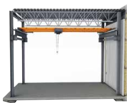
Top-running crane – Type 2