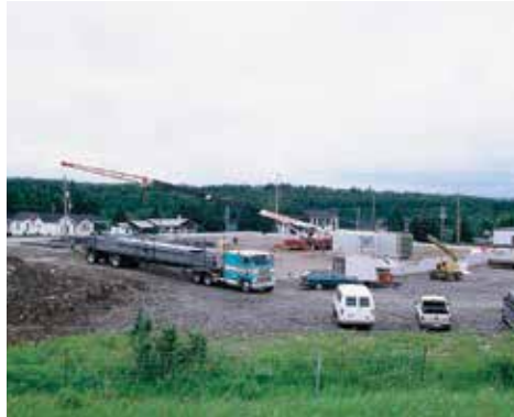
Start of construction

While the foundations are being installed at the job site, the Canam team is already at work in the plant, manufacturing the system components under ideal conditions. Personnel doors and windows are installed at the plant.