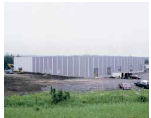
End of construction

Erection of the steel structure and wall panels is completed. Once the steel deck is installed, the other sub-trades can start working.