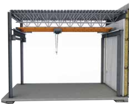
Top-running crane – Type 1

Murox panels offer advantages for buildings that require overhead cranes. Canam's technical team will guide you to the best solution to support the overhead crane that you have selected.