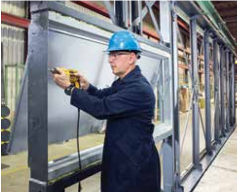
At the plant

Typical steps for the installation of a 55,000 sq. ft. warehouse: